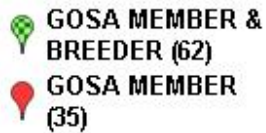
GOS MEMBER BREEDER MAP SEP 2013